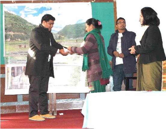
Photo 3: Prize distribution on YPARD Nepal Family Farming Photo Contest